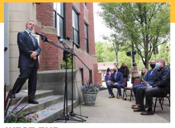
WEST END I spoke at the ribbon-cutting ceremony for Pittsburgh Musical Theater's recent revitalization project.

I was happy to advocate for state funding that allows Crafton to begin the sewer separation project along Crafton Boulevard.